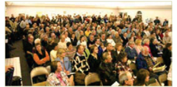
Crowd of 300 attend public hearing